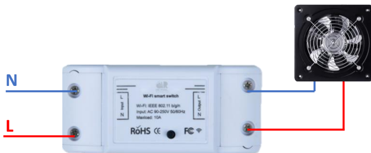
b. Appliance wiring instruction